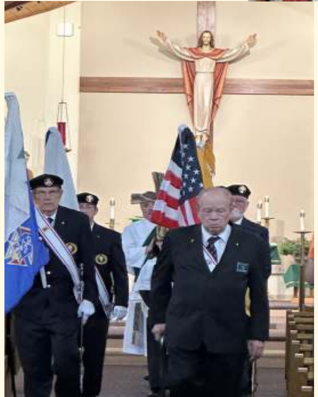
Saints Peter & Paul pray for us.