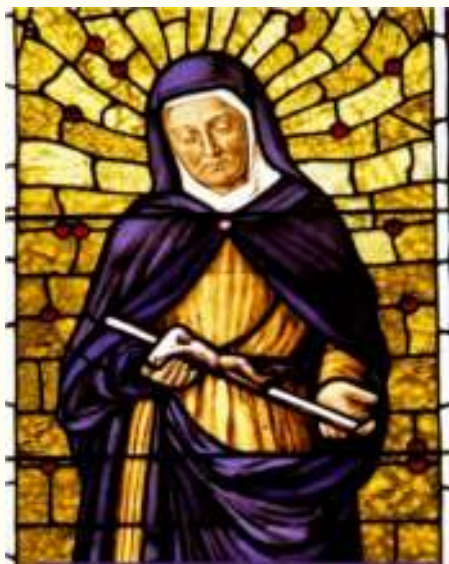
Saint Monica pray for us

In the name of the Father and of the Son and of the Holy Spirit, Amen.