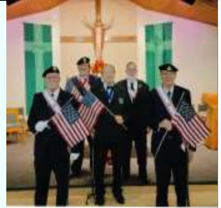
Knights of Columbus, Sunday, Sept. 11, 2022