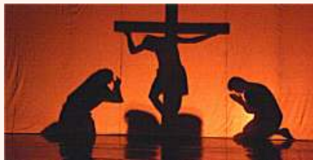
Saint's Peter & Paul Church All are welcome!